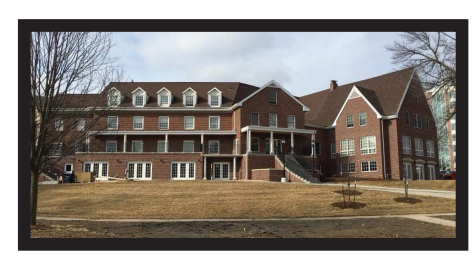
Alpha Gamma Rho Eta Chapter, Iowa State University 201 Gray Avenue Ames, Iowa 50014

Please update your email with Eta Chapter AGR! If you haven't been receiving emails from us containing important event information and chapter updates, please send us your email address to jermier9@iastate.edu